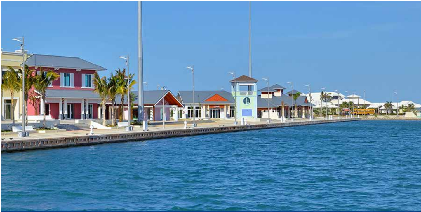
TOURIST VILLAGE WITH A COMMERCIAL PROMENADE • MARINA AND DIVING • HOTEL & APARTMENTS VARADERO

Autopista del Sur y Final, Punta Hicacos, Varadero, Matanzas.Cuba C.P: 42200. Telf: (53 45) 66 7330. meliamarinavaradero@meliacuba.com www.melia-marinavaradero.com f MeliaMarinaVaradero