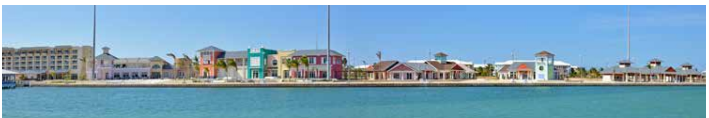
Plaza Las Morlas Town

Local transport: Taxis, bus, car hire and Varadero Bus Tour. Nearest international airport: Varadero (Juan Gualberto Gómez), 34 km (40 minutes). Havana international airport, 139 km (2 hours).