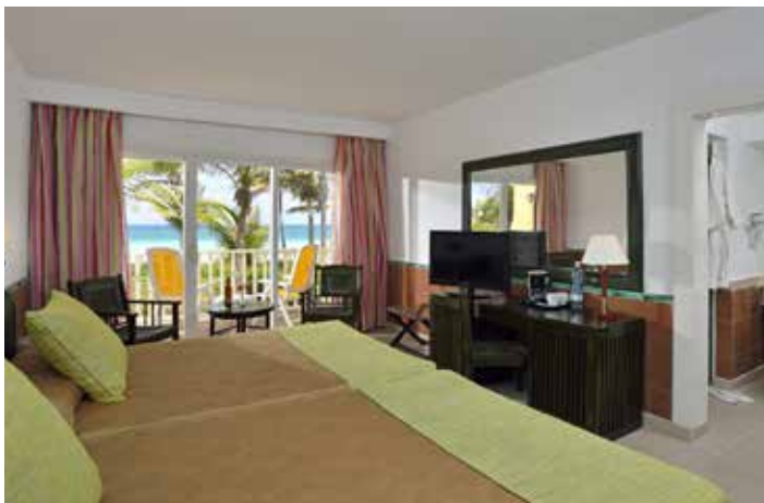
Sea View Superior Room

Maximum occupancy per room: Double occupancy and double for single occupancy. In all room types: 2 adults + 2 children (0-12 years). Only one extra bed or cot for children (on request) allowed per room.