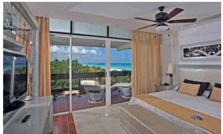
Superior Room Concierge Service