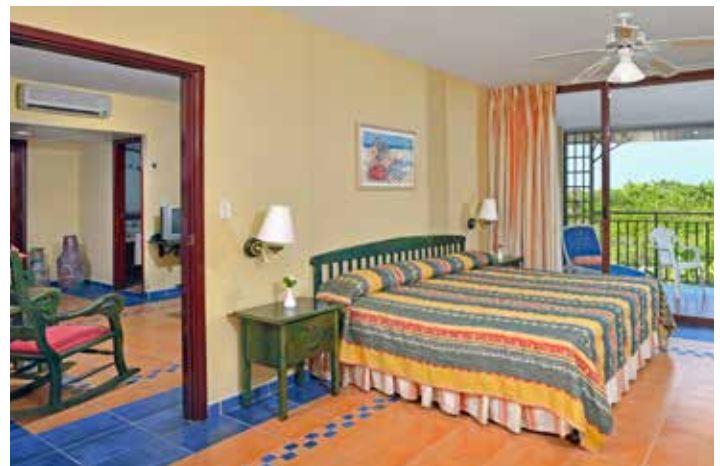
Suite Sea View