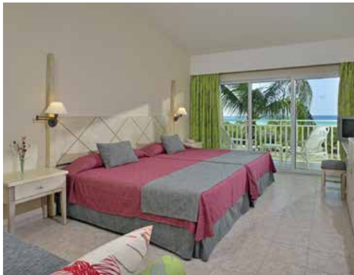
Standard Room Sea View