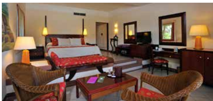
Paradisus Junior Suite

Maximum occupancy per room: Double occupancy or double for single occupancy. Adults Only (18 years or over). Maximum room occupancy: 3 adults. Only 1 extra bed allowed per room. Maximum occupancy in Royal Service rooms: 2 adults.