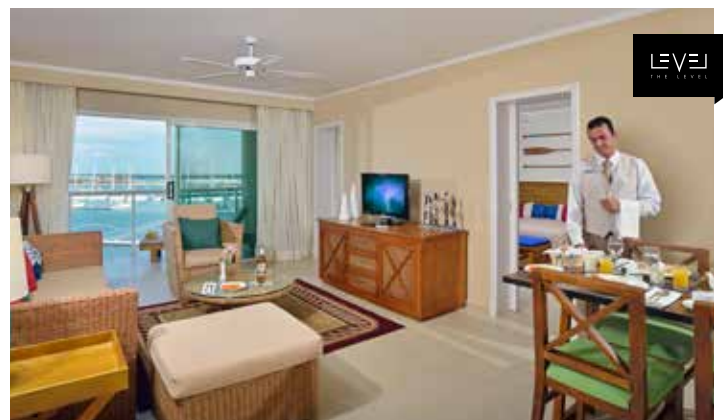
The Level Grand Suite Marina View