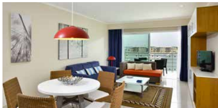
Two Bedroom Apartment