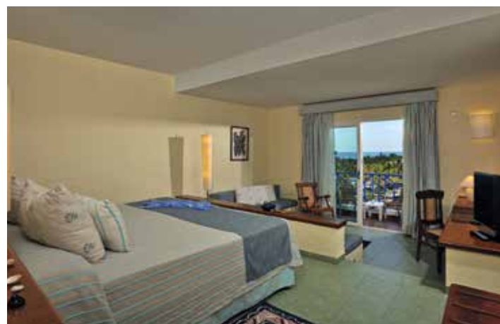
Junior Suite Vista Mar

Rooms with sea views. Area: 38.76 m 2 . Layout: hall, bedroom/lounge, rocking chair and lounge sofa, bathroom and terrace. Concierge Floor Services.*