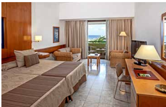
Classic Room Sea View

Maximum occupancy per room: Double occupancy and double for single occupancy. In all room types: 3 adults or 2 adults + 2 children (0-12 years). Only one extra bed or cot allowed per room. Extra bed on request. Adult or child (2-12 years). Baby (0-2 years). Children accompanied by adults.