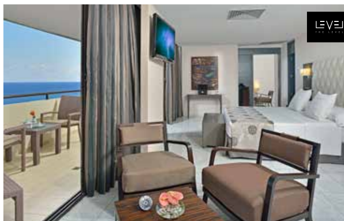
The Level Grand Suite