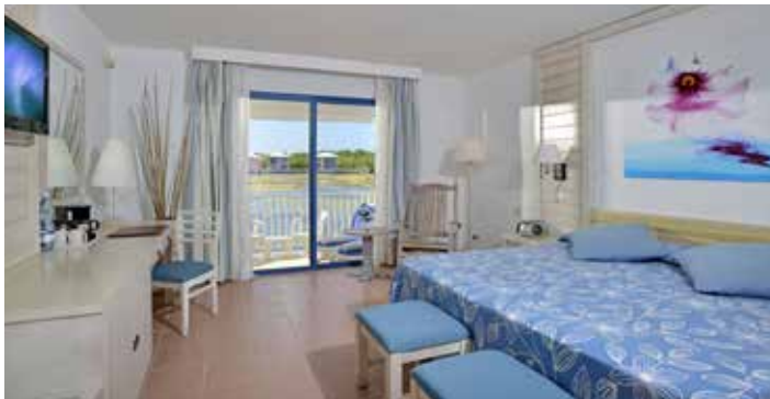
Grand Premium Room Lagoon View

Maximum occupancy per room: Double occupancy and double for single occupancy. In all room types: 3 adults. Only one extra bed (on request) allowed per room.