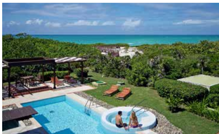
Villa Zaida del Río The Level