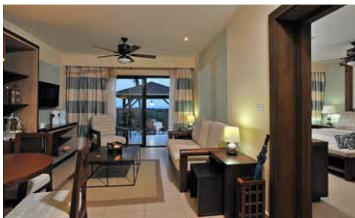
Royal Suite The Level

Maximum occupancy per room: Double occupancy or double for single occupancy. Adults only, 18 years or over. In all room types: 2 adults or 1 adult. No extra bed or third person admitted. Maximum occupancy per room 2 adults.